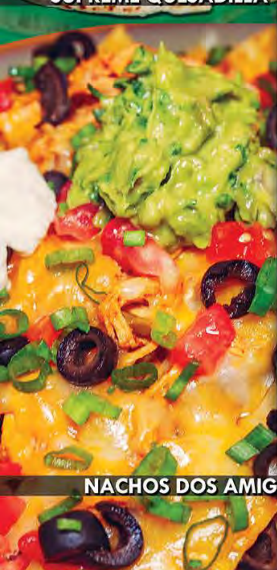
NACHOS DOS AMIGOS