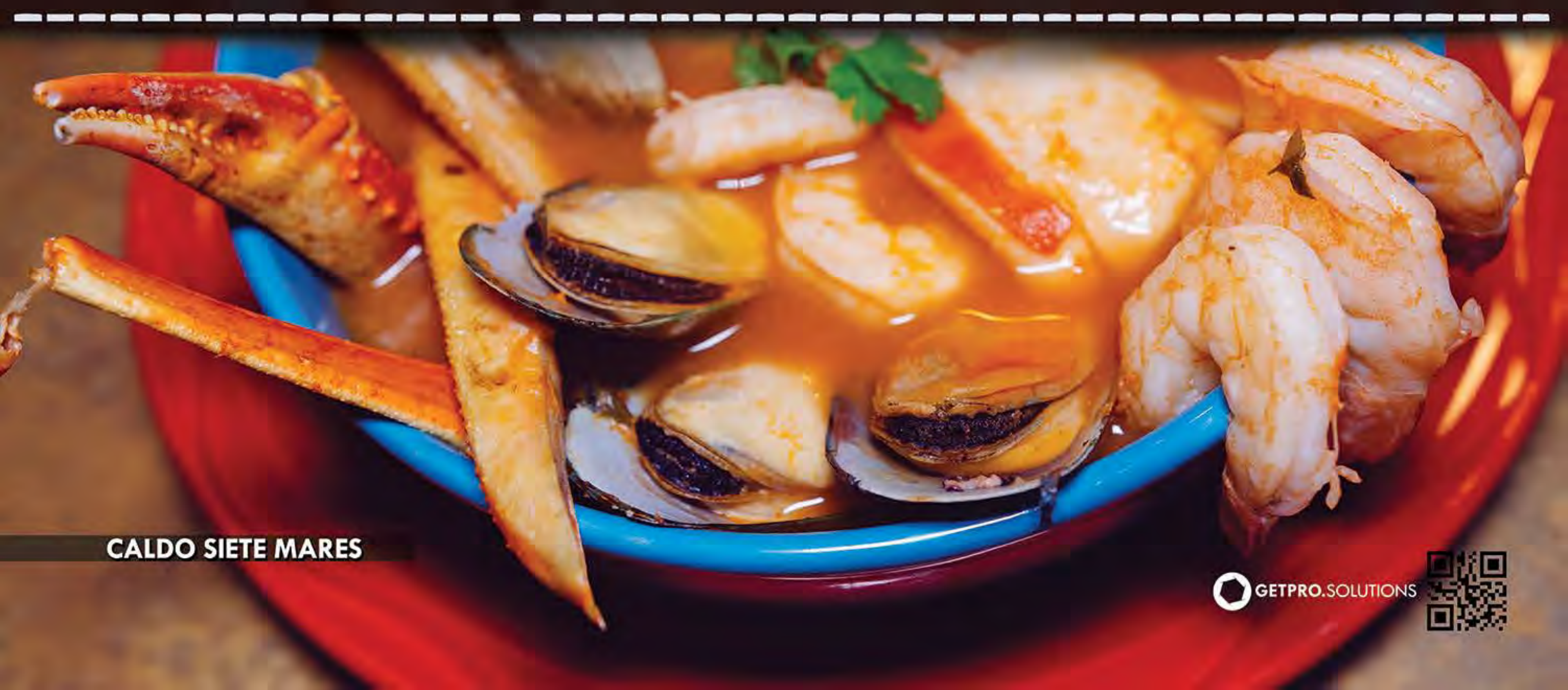
CALDO SIETE MARES

Fish, octopus, scallops, shrimps, oysters, crab legs and clams. Seafood jumbo soup. 26.95